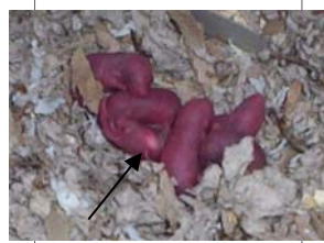
Milk is visible in belly.

When pups are first born, they weigh about as much as a penny. They are blind, deaf, and helpless. They have no fur. All they have to decipher their surroundings is their noses. When they are