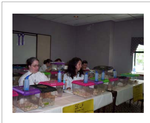
The show hall is full of gerbils being judged.

During the judging, the pet class is judged. The pet class is a class where children can enter their gerbils. The prizes are rewarded for things like